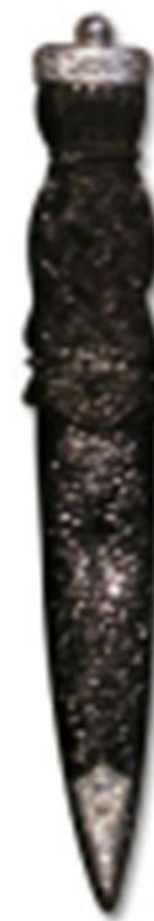
Art :- WI-279