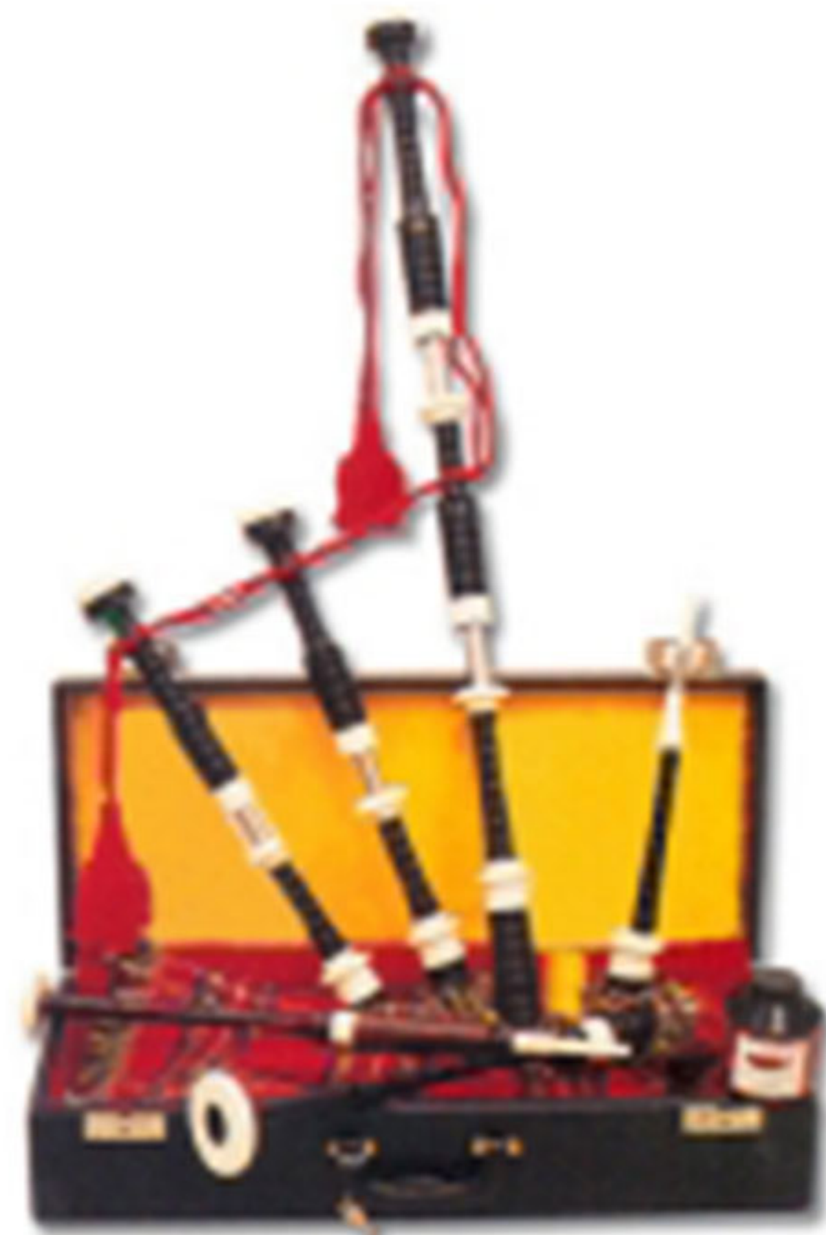
Art :- WI-187