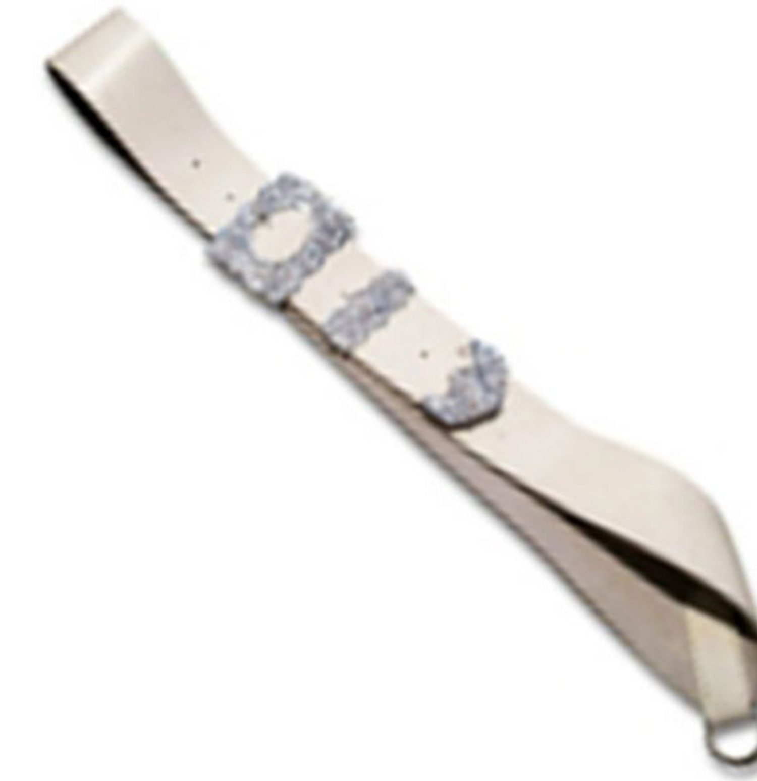
Art :- WI-234