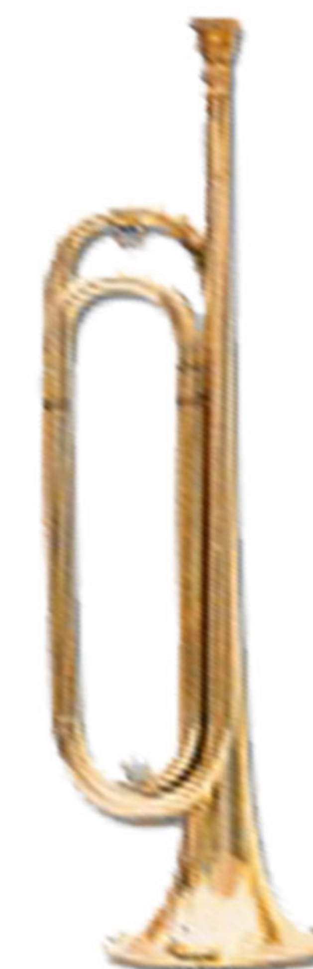
Art :- WI-202