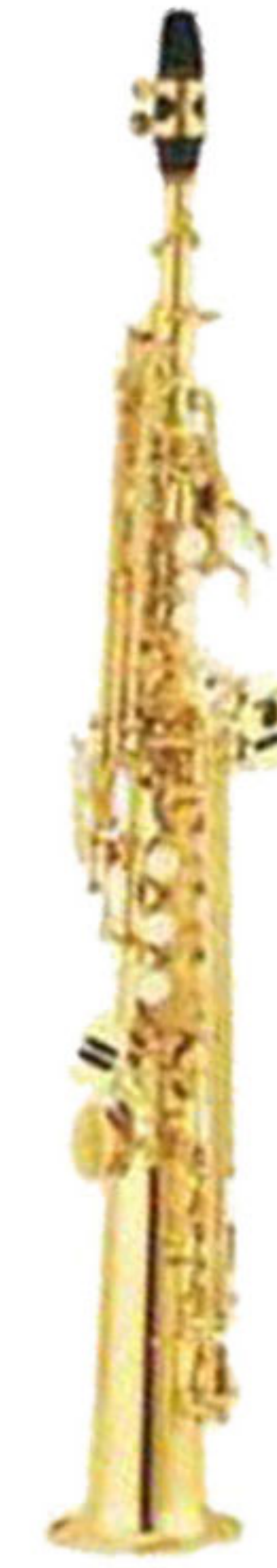
Art :- WI-216