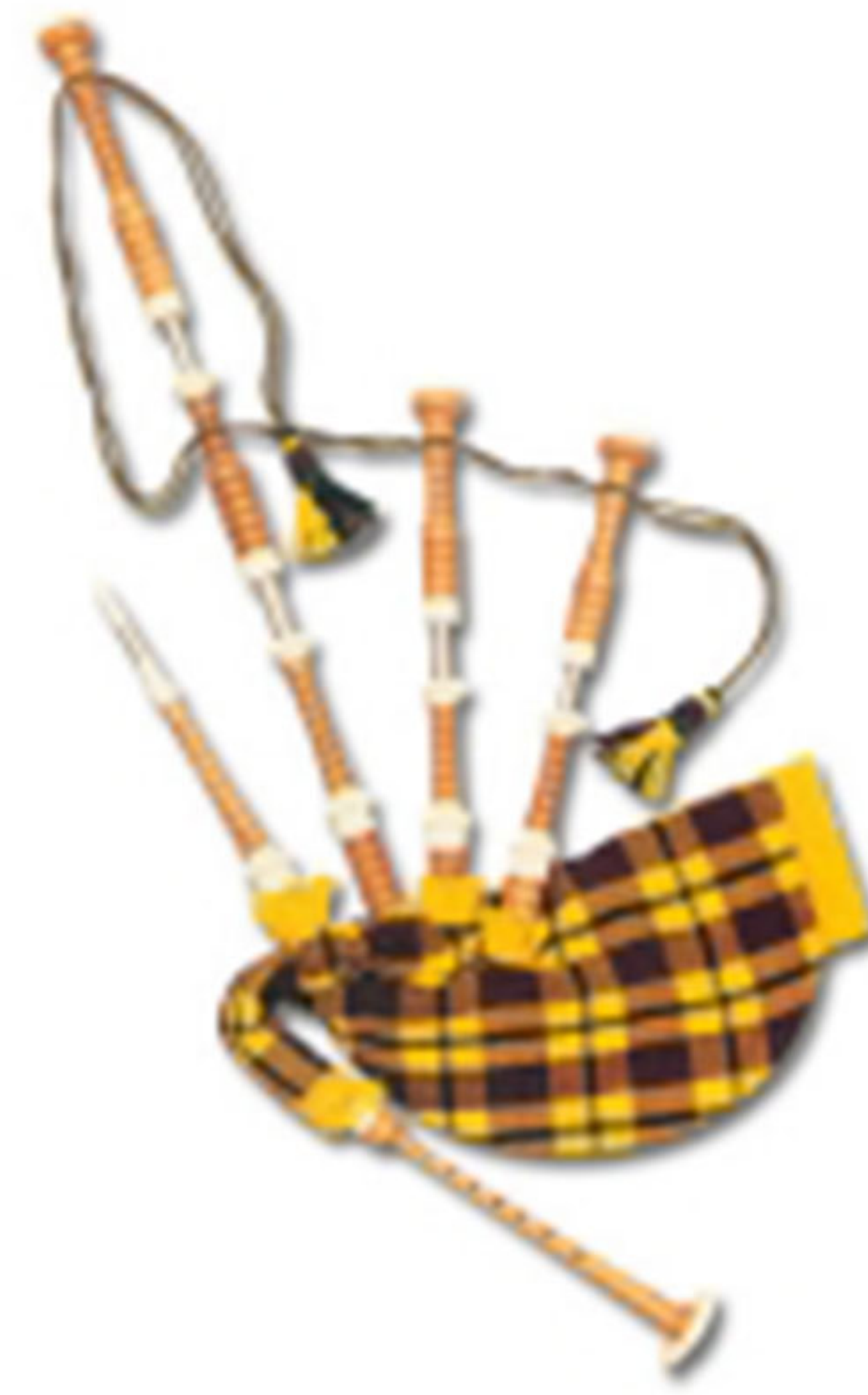
Art :- WI-185