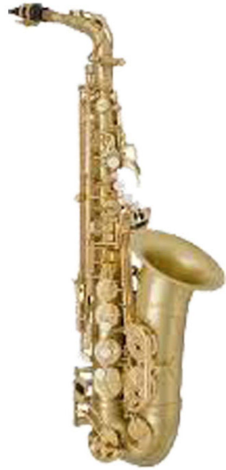
Art :- WI-214