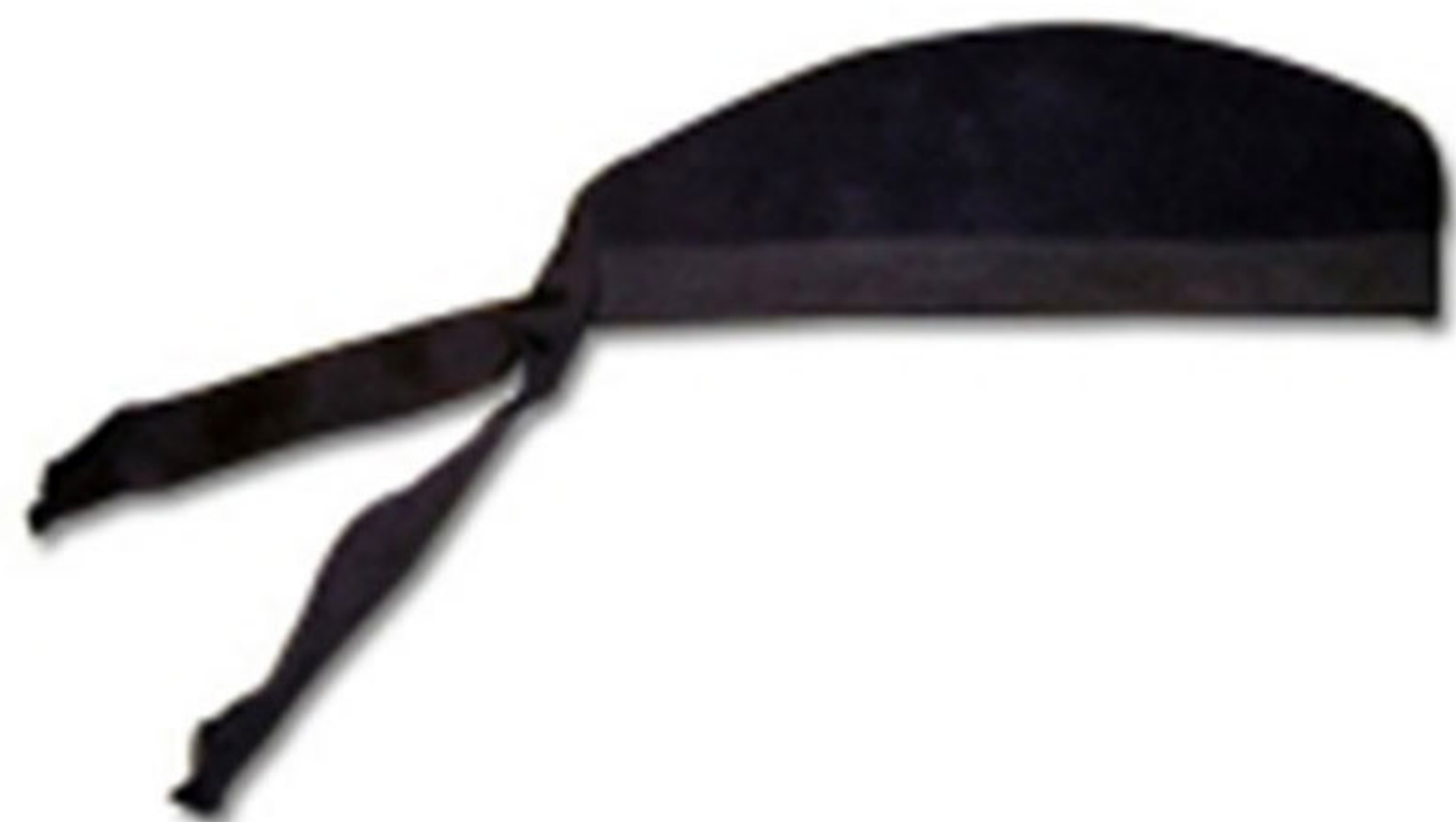
Art :- WI-256