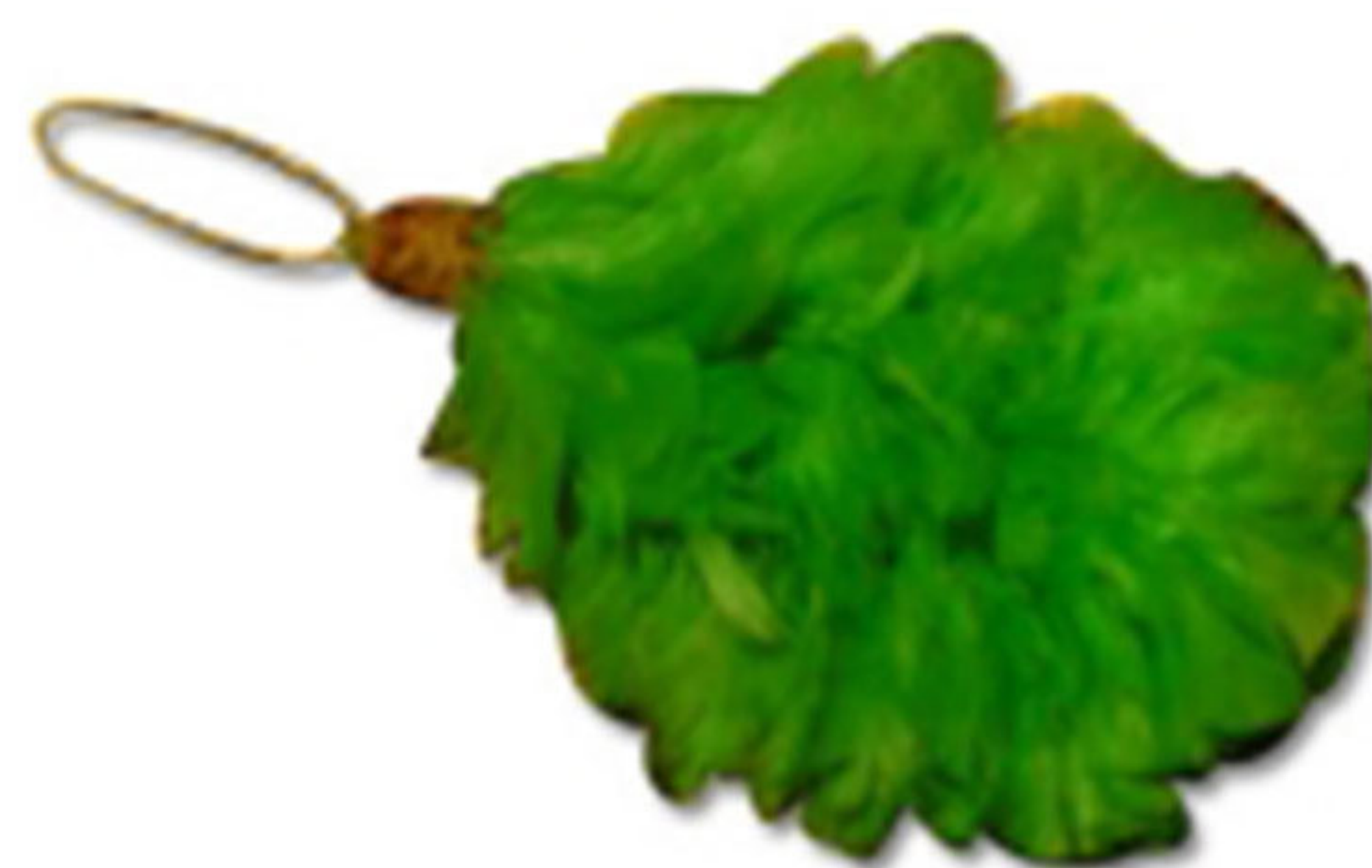
Art :- WI-263