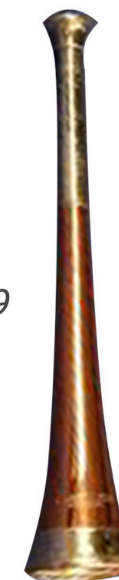
Art :- WI-217 UP TO WI-219