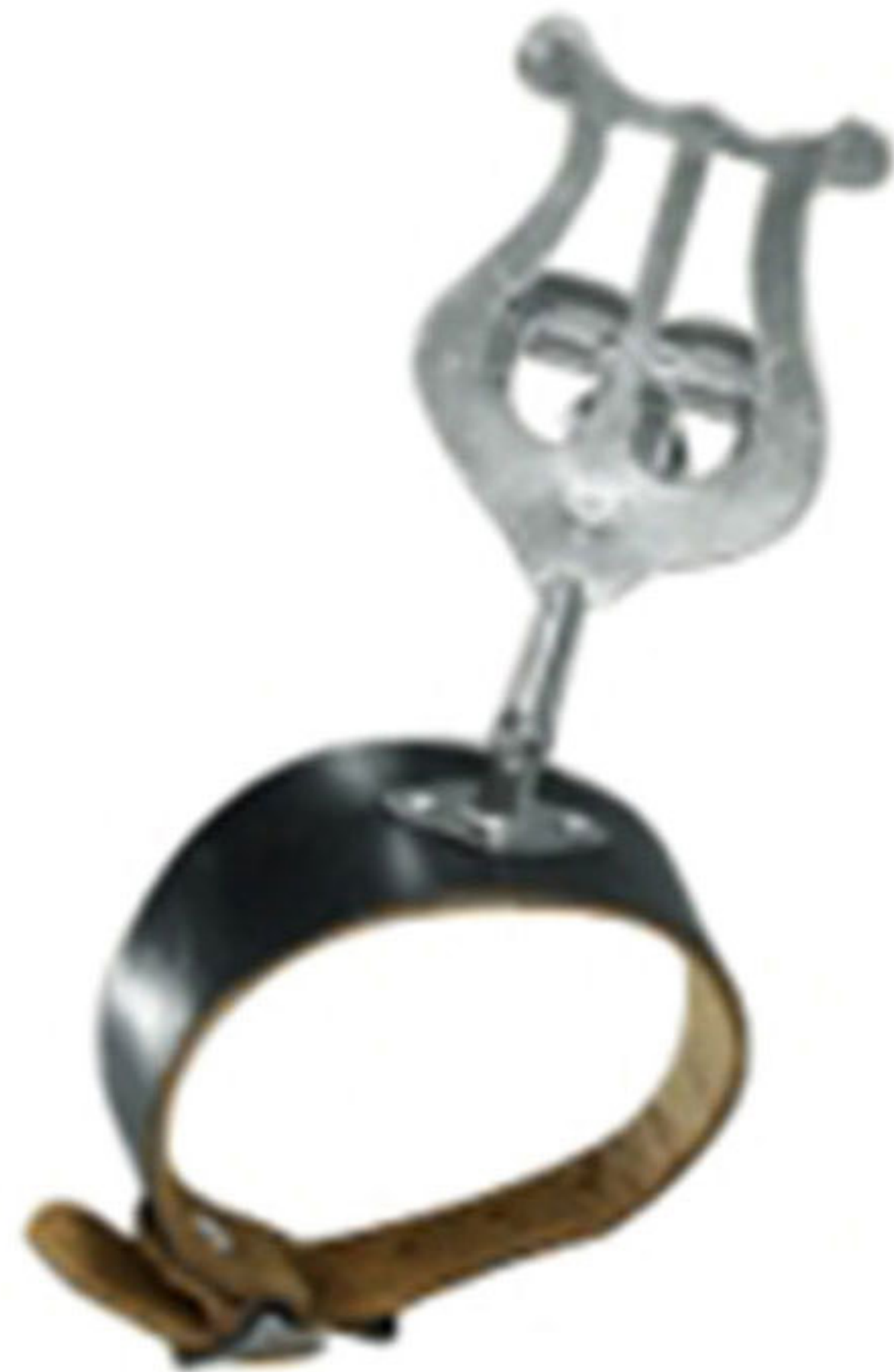
Art :- WI-231