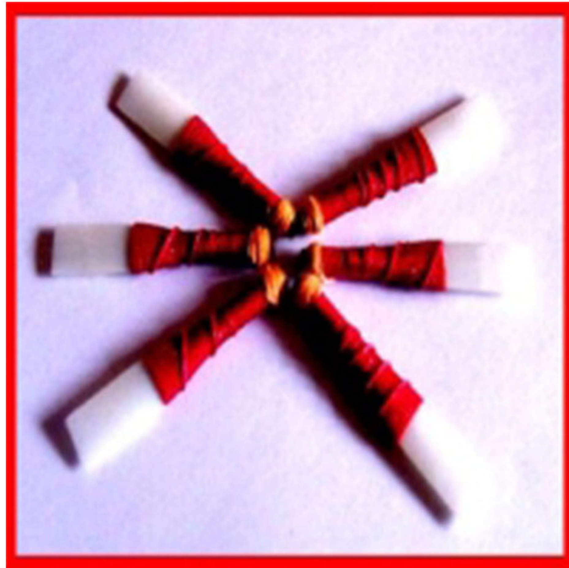
Art :- WI-194