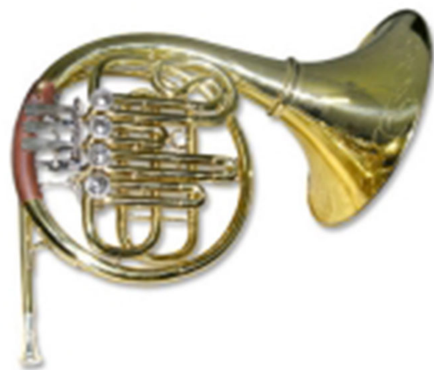
Art :- WI-226