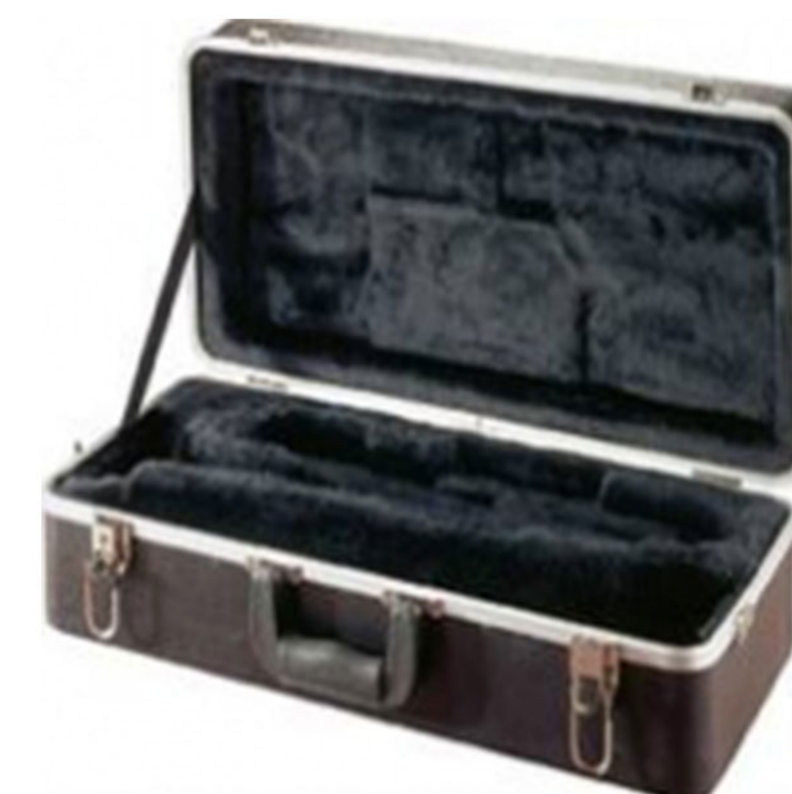
Art :- WI-224