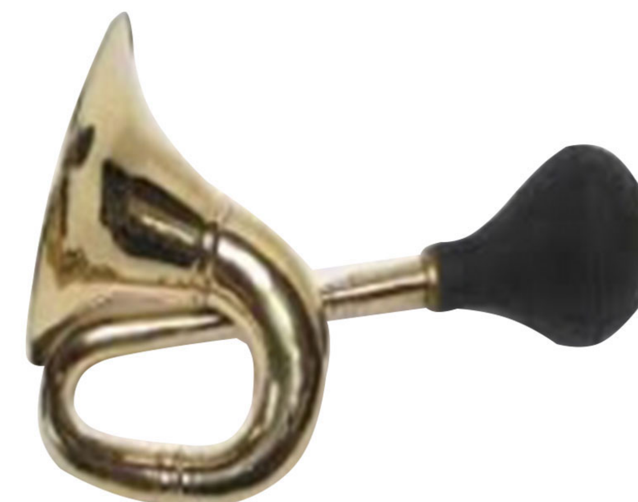
Art :- WI-220