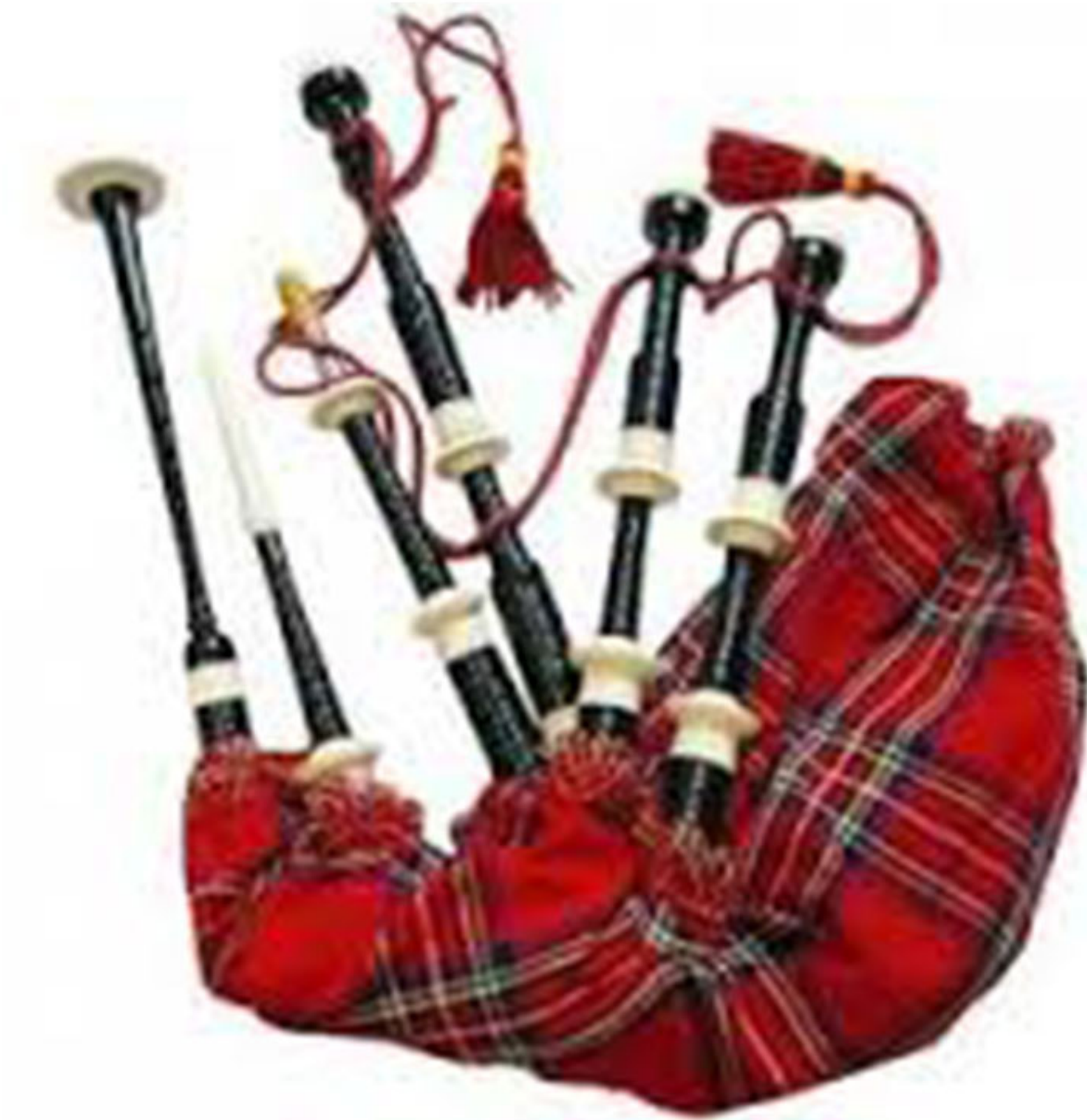
Art :- WI-186