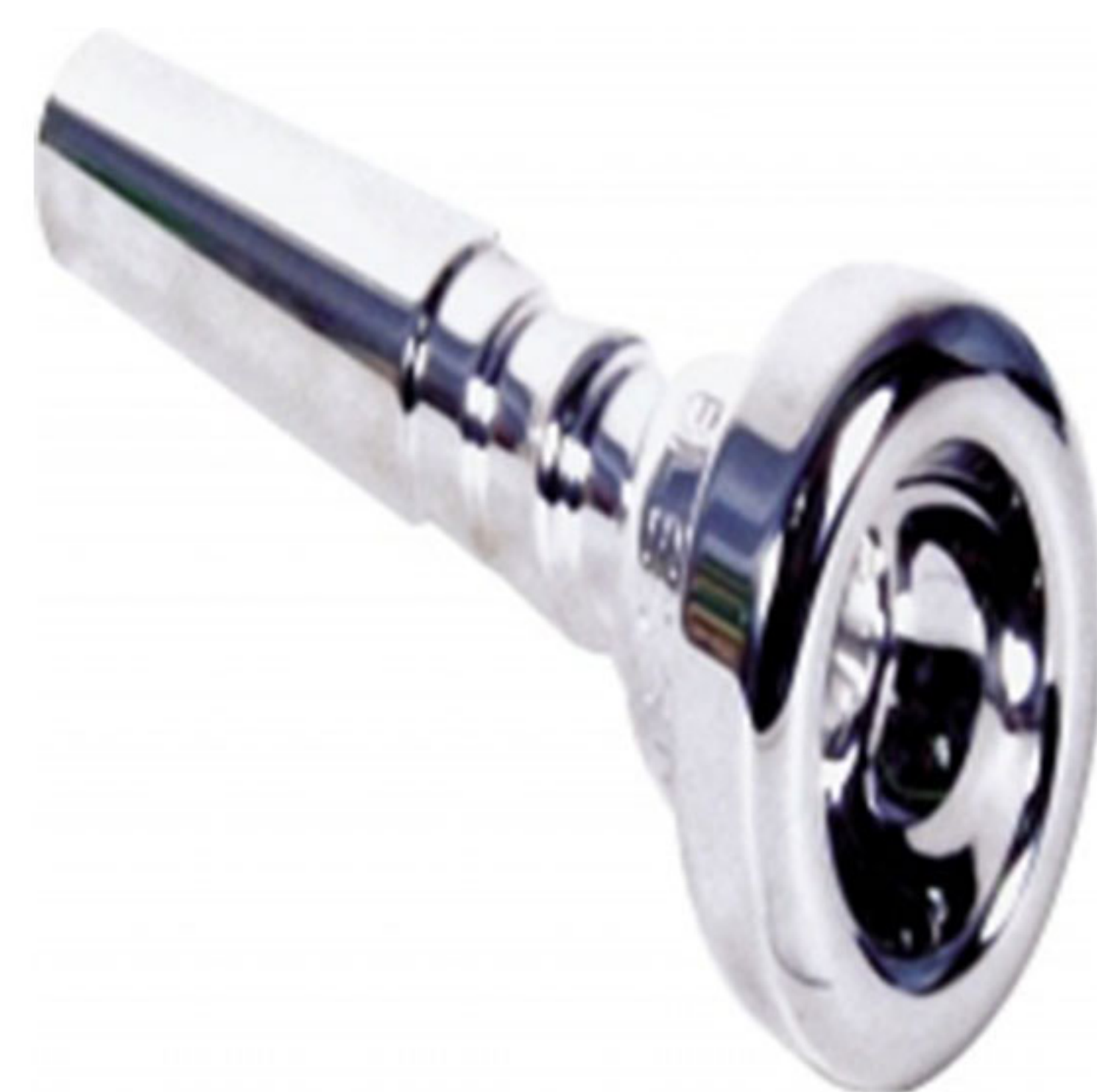
Art :- WI-225