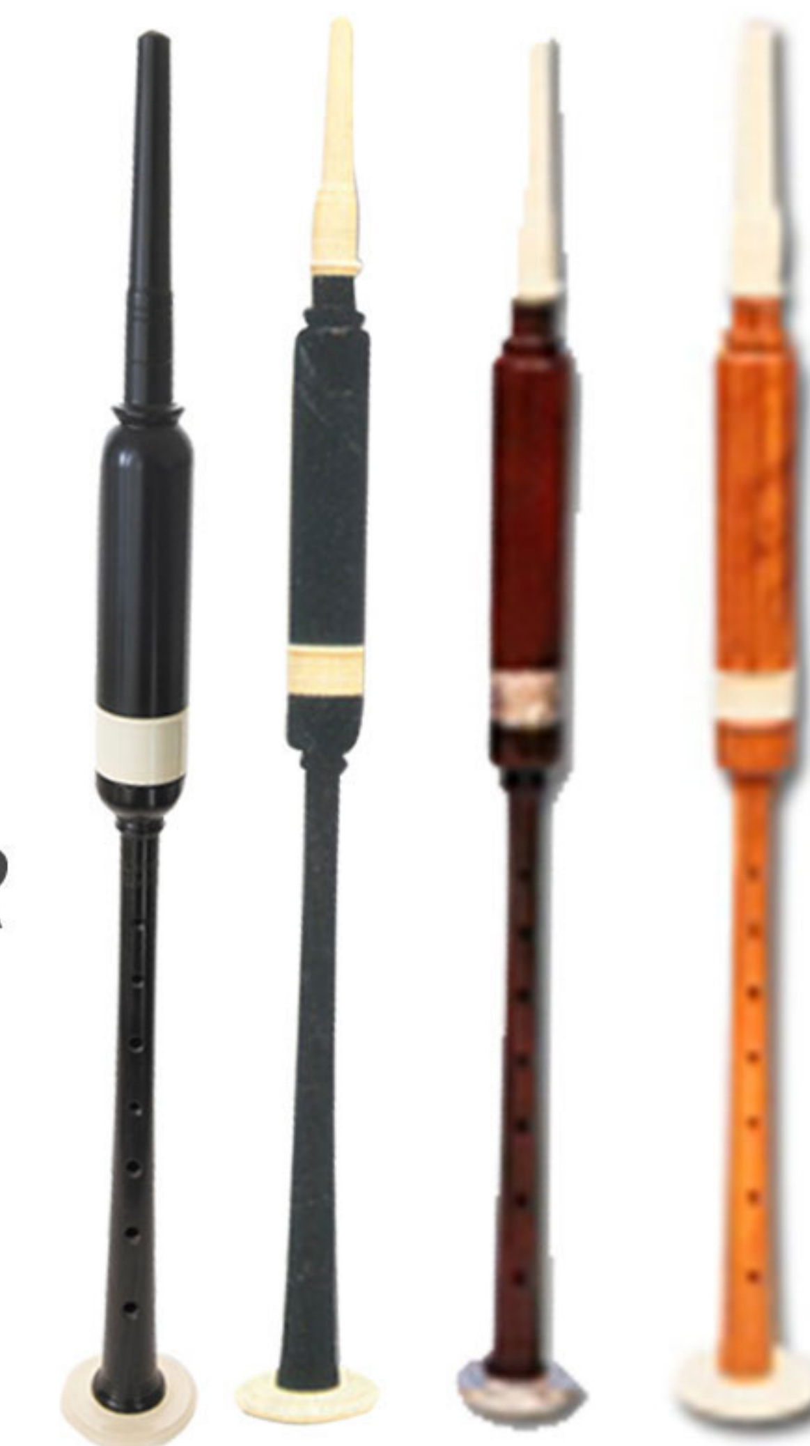
Art :- WI-192 UP TO WI-193