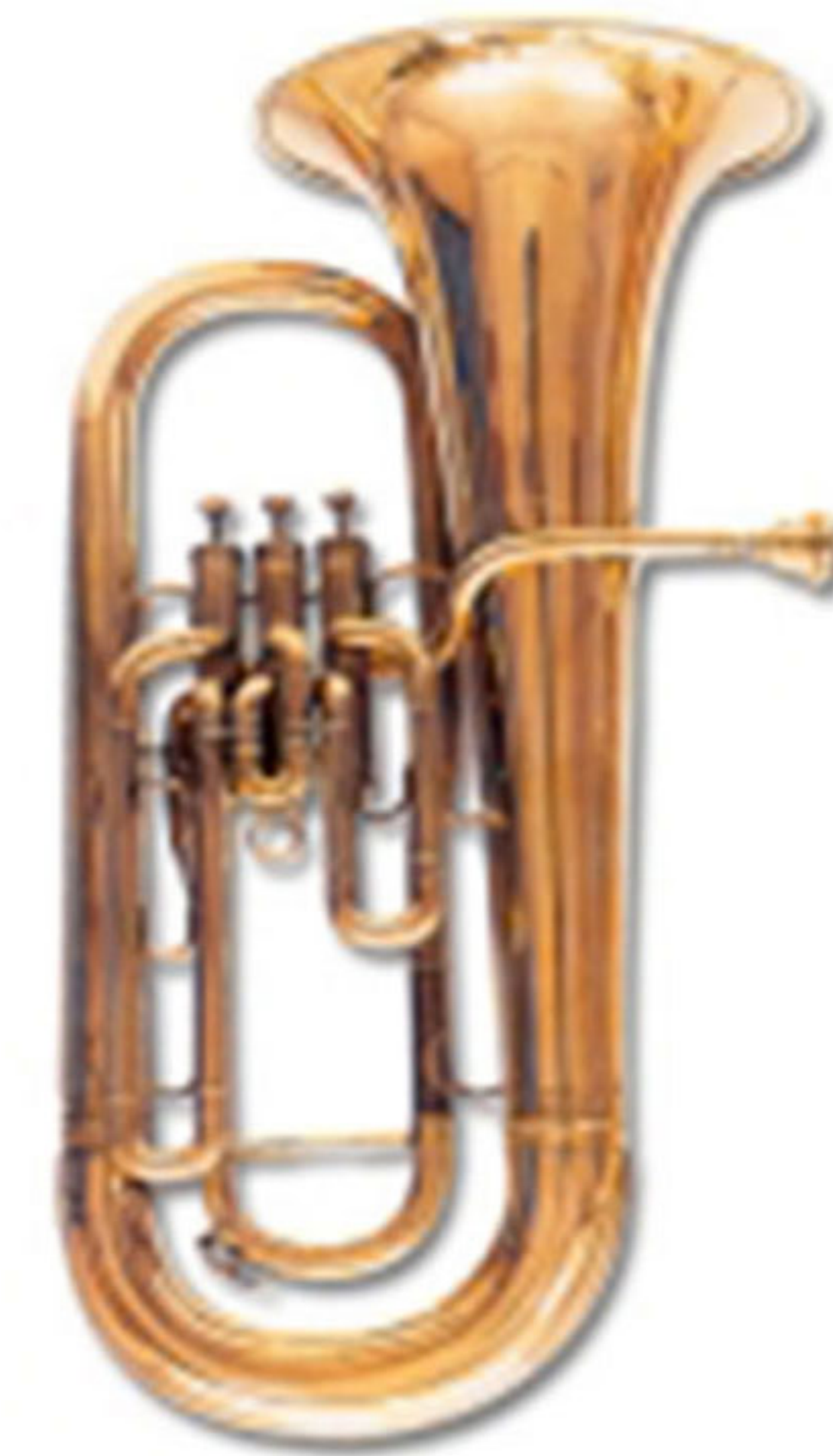
Art :- WI-207