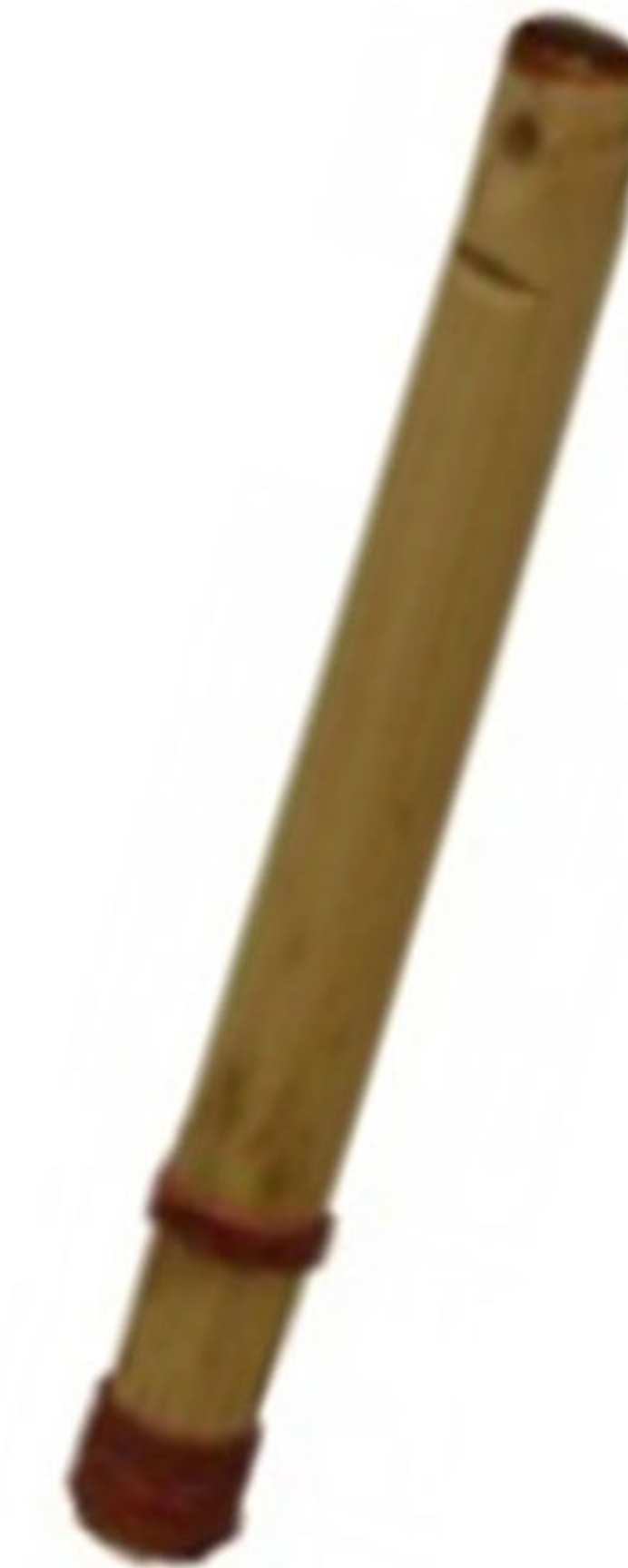
Art :- WI-196