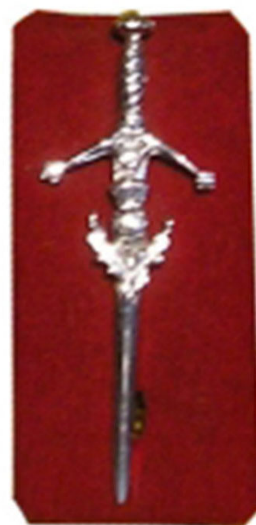
Art :- WI-264