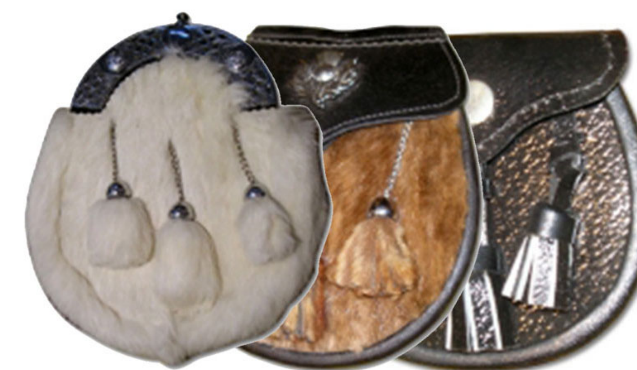
Art :- WI-281 UP TO WI-287