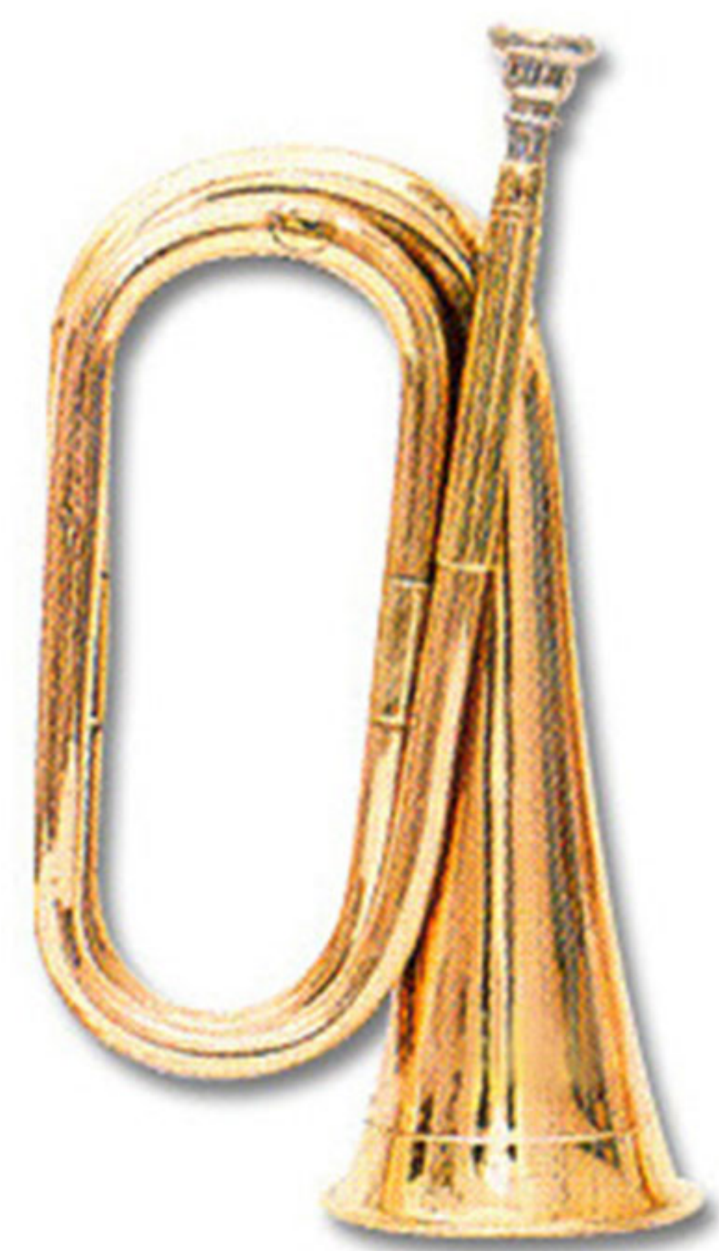
Art :- WI-197 UP TO WI-199