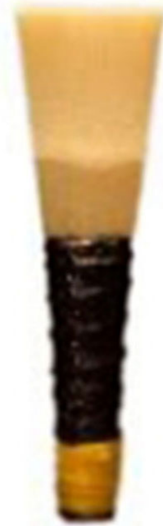
Art :- WI-195