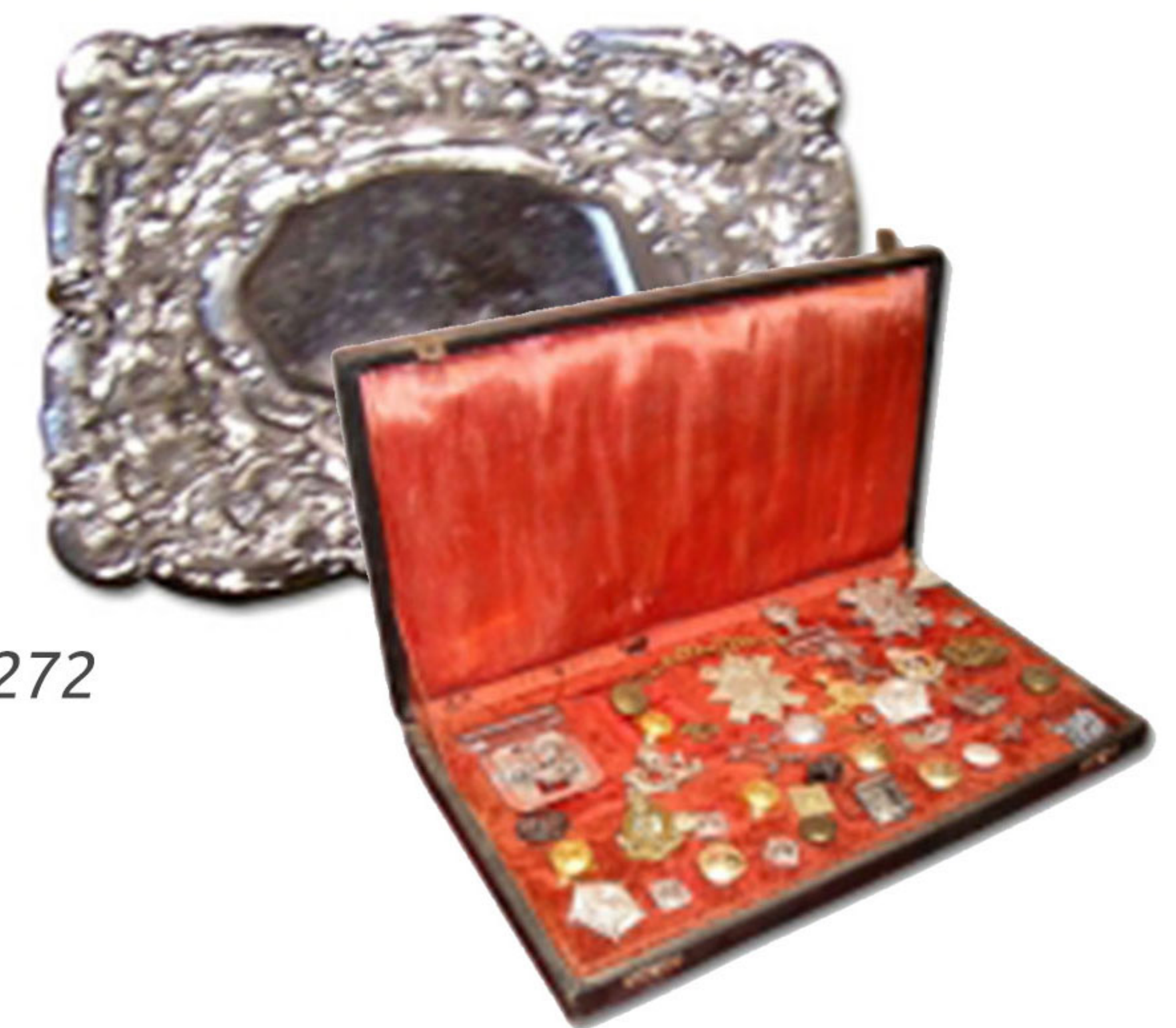
Art :- WI-259-WI-272