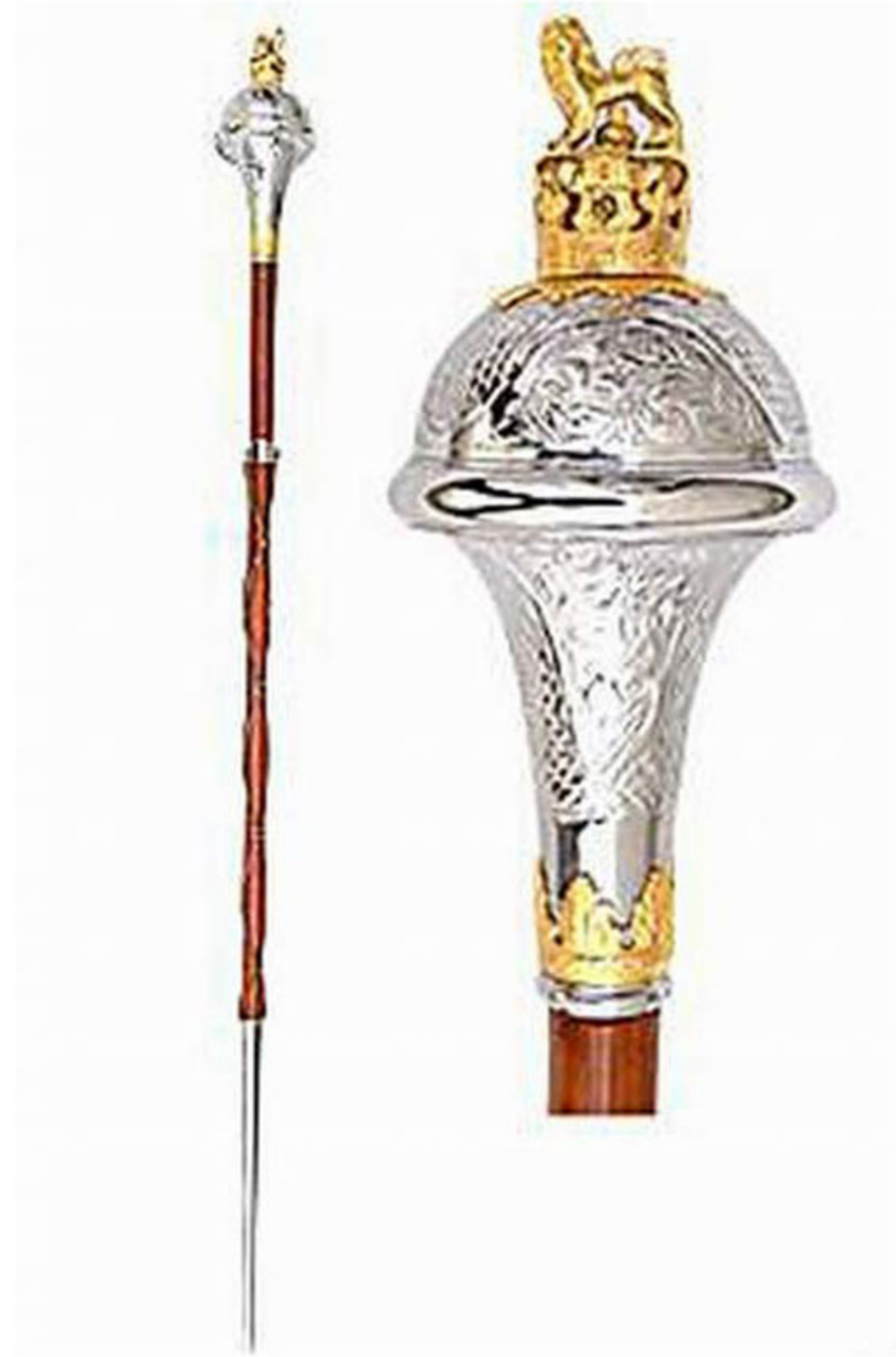
Art :- WI-293