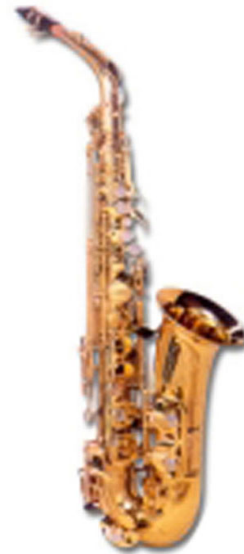
Art :- WI-215