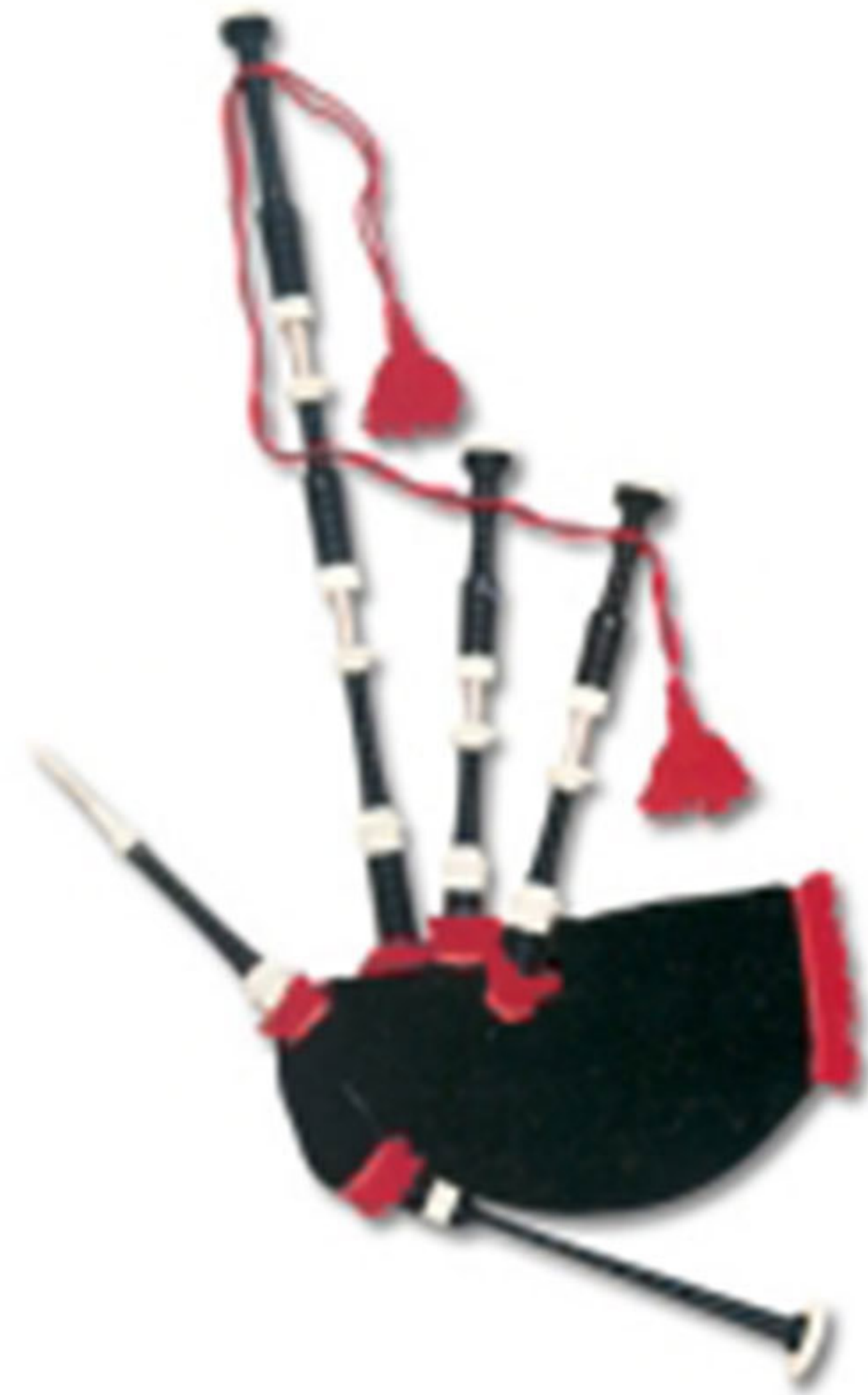
Art :- WI-183