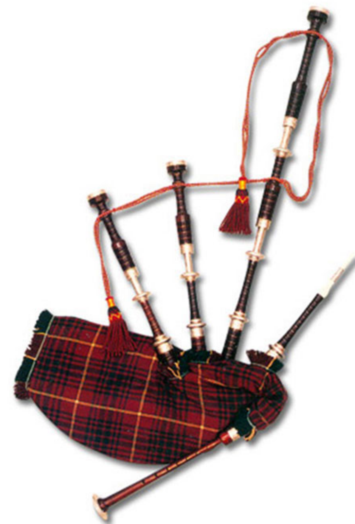
Art :- WI-189