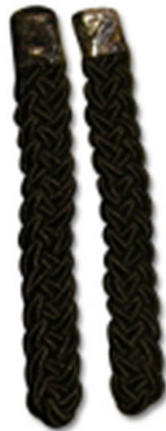
Art :- WI-248