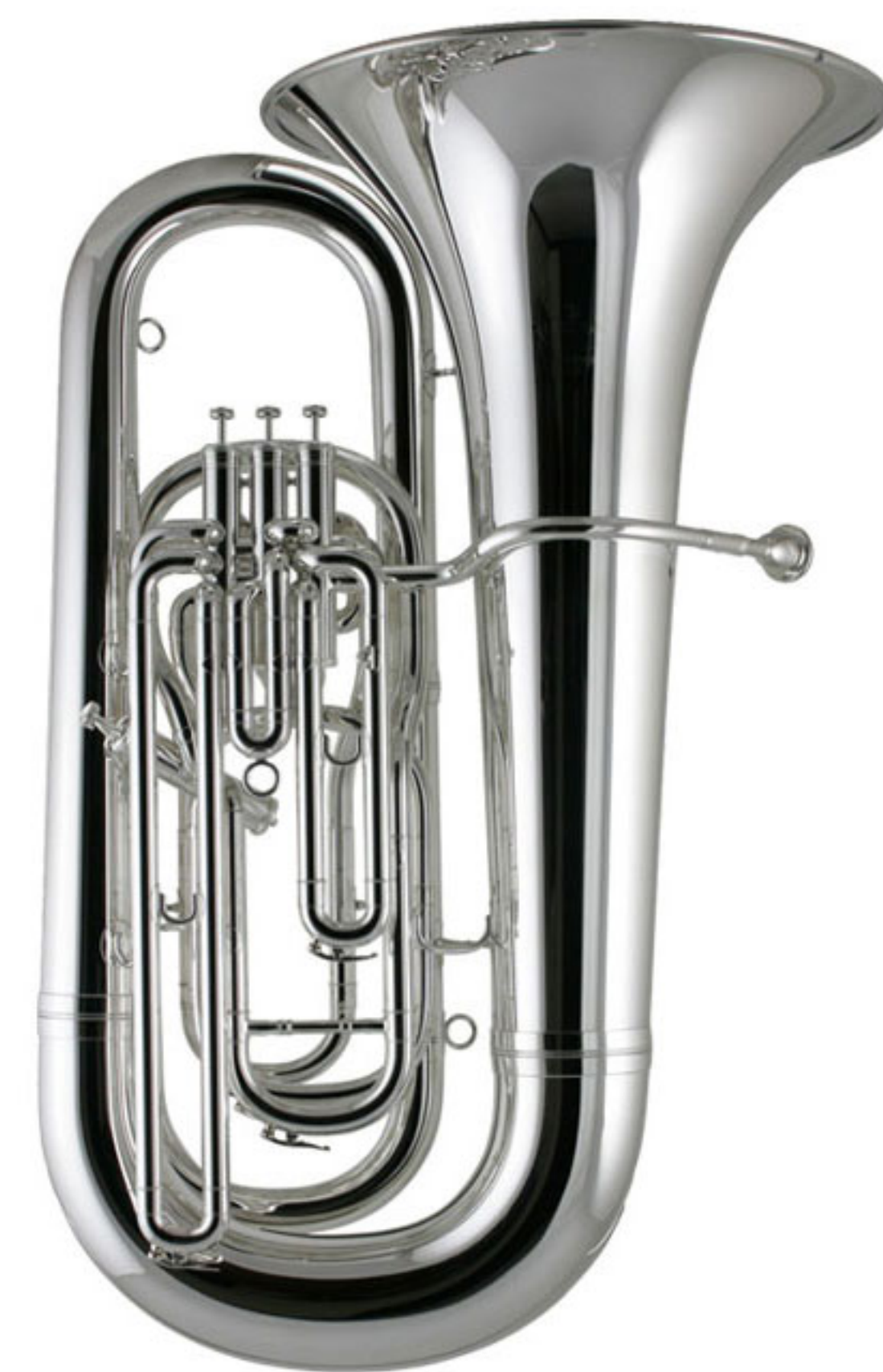
Art :- WI-212