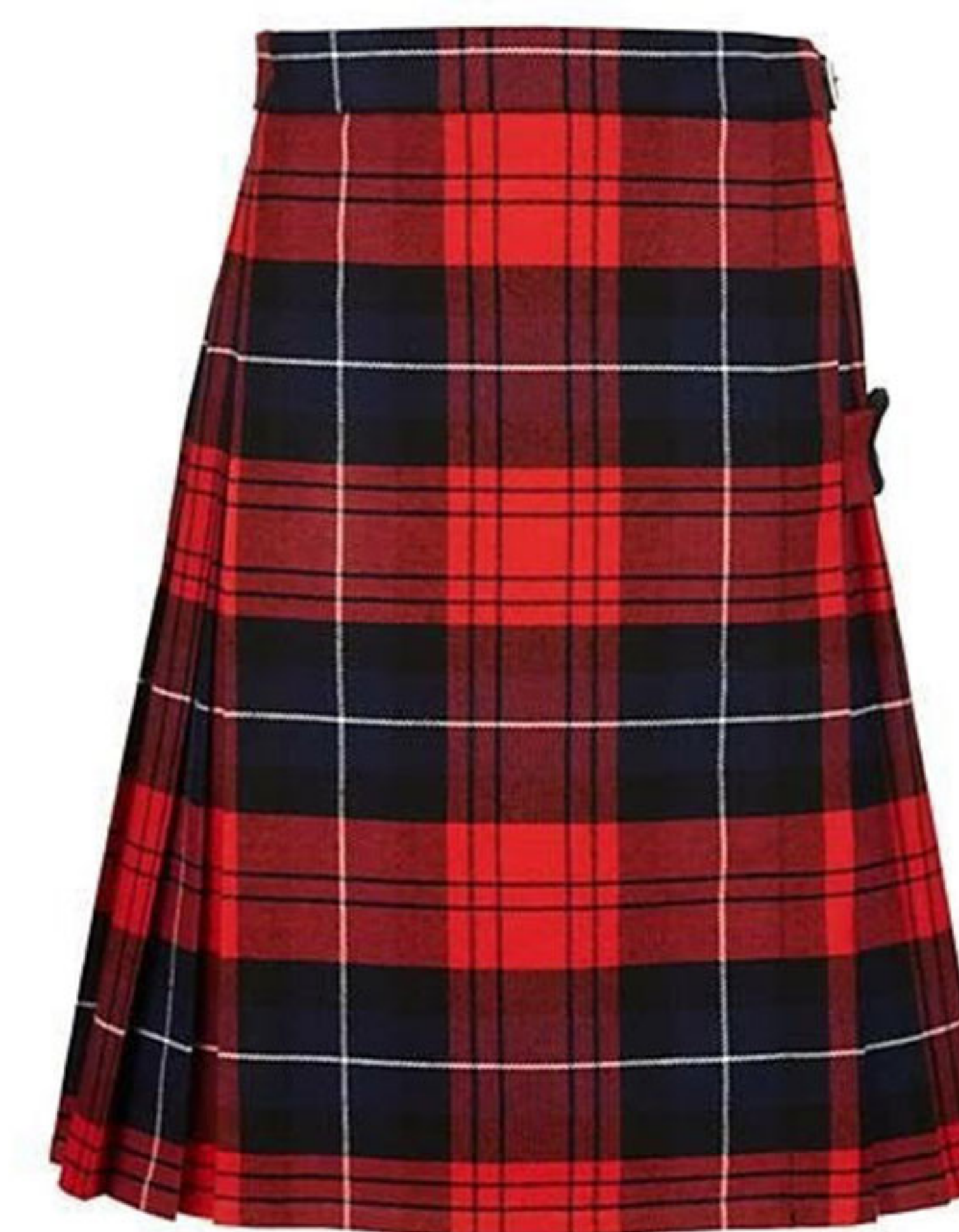
Art :- WI-258