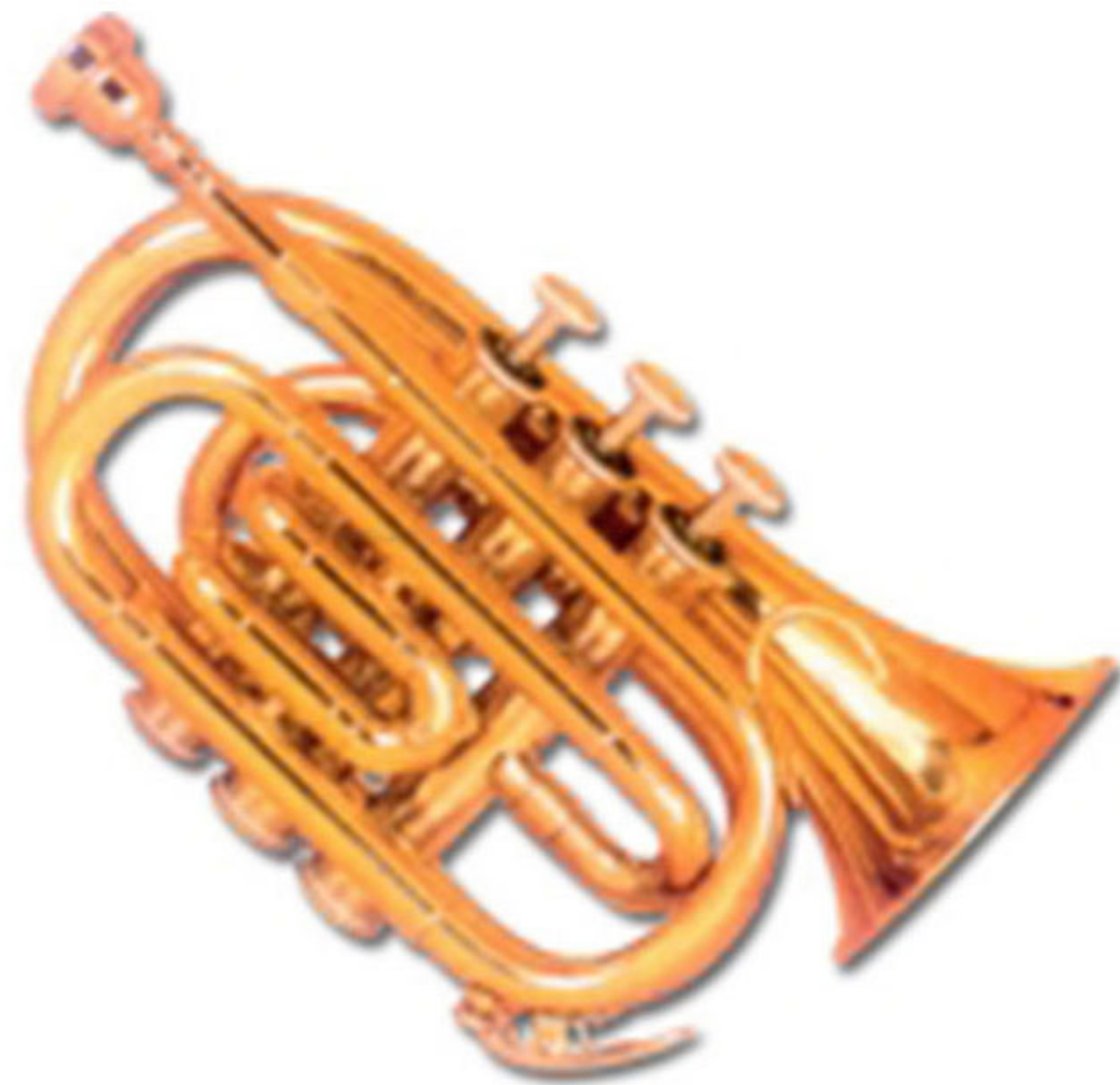
Art :- WI-213