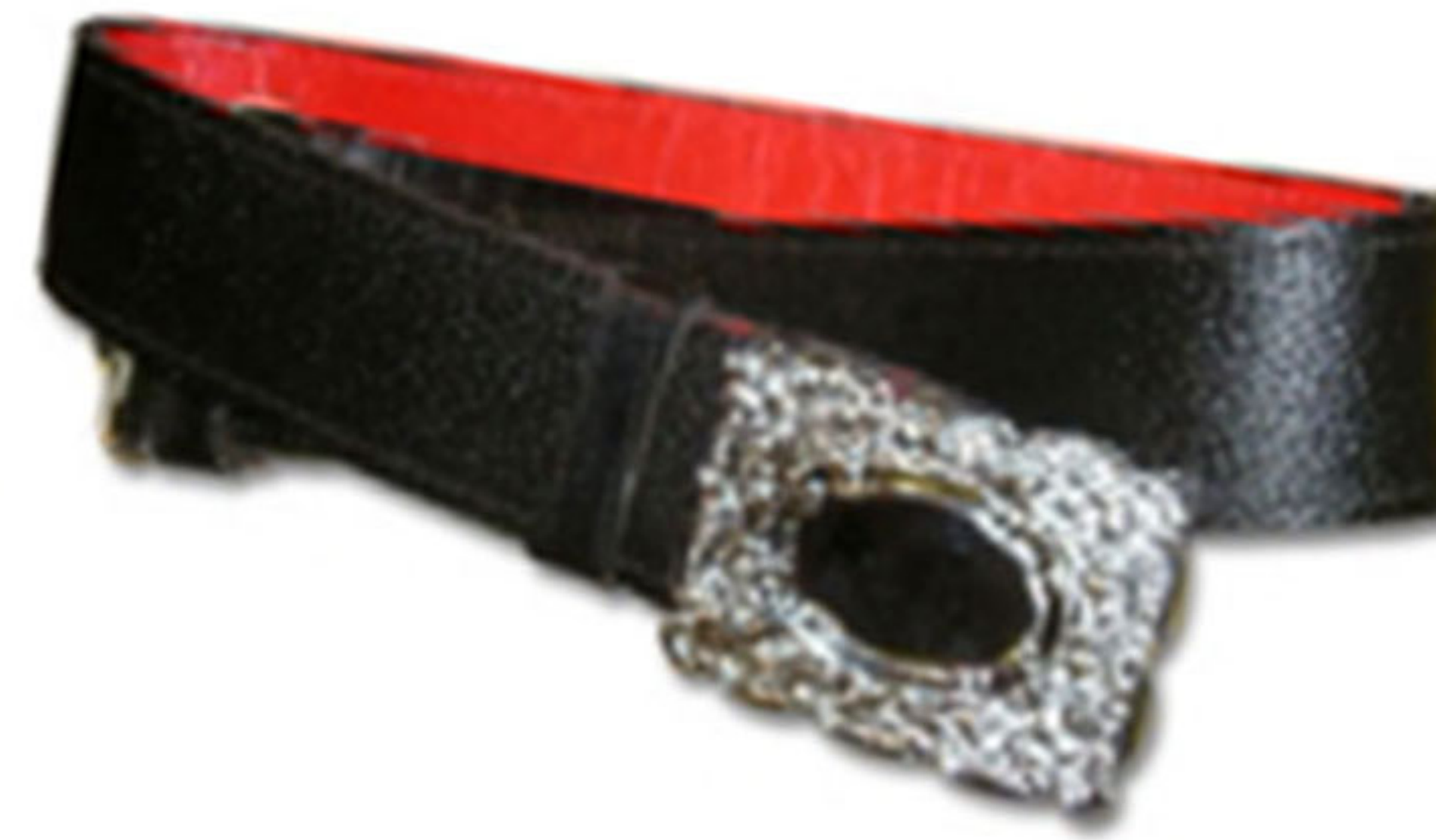
Art :- WI-240