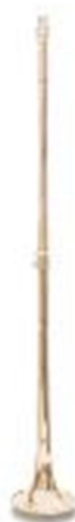
Art :- WI-200 -WI-201