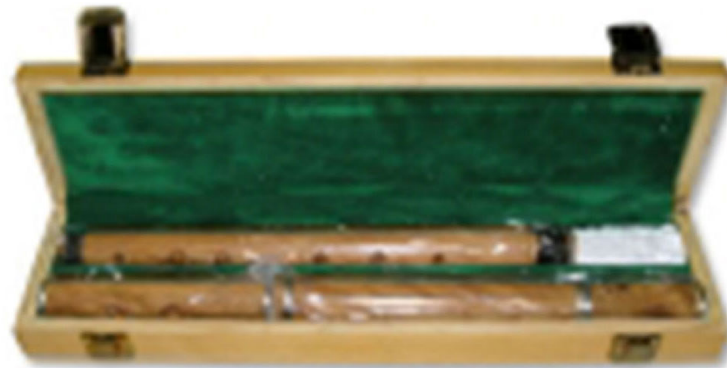
Art :- WI-233