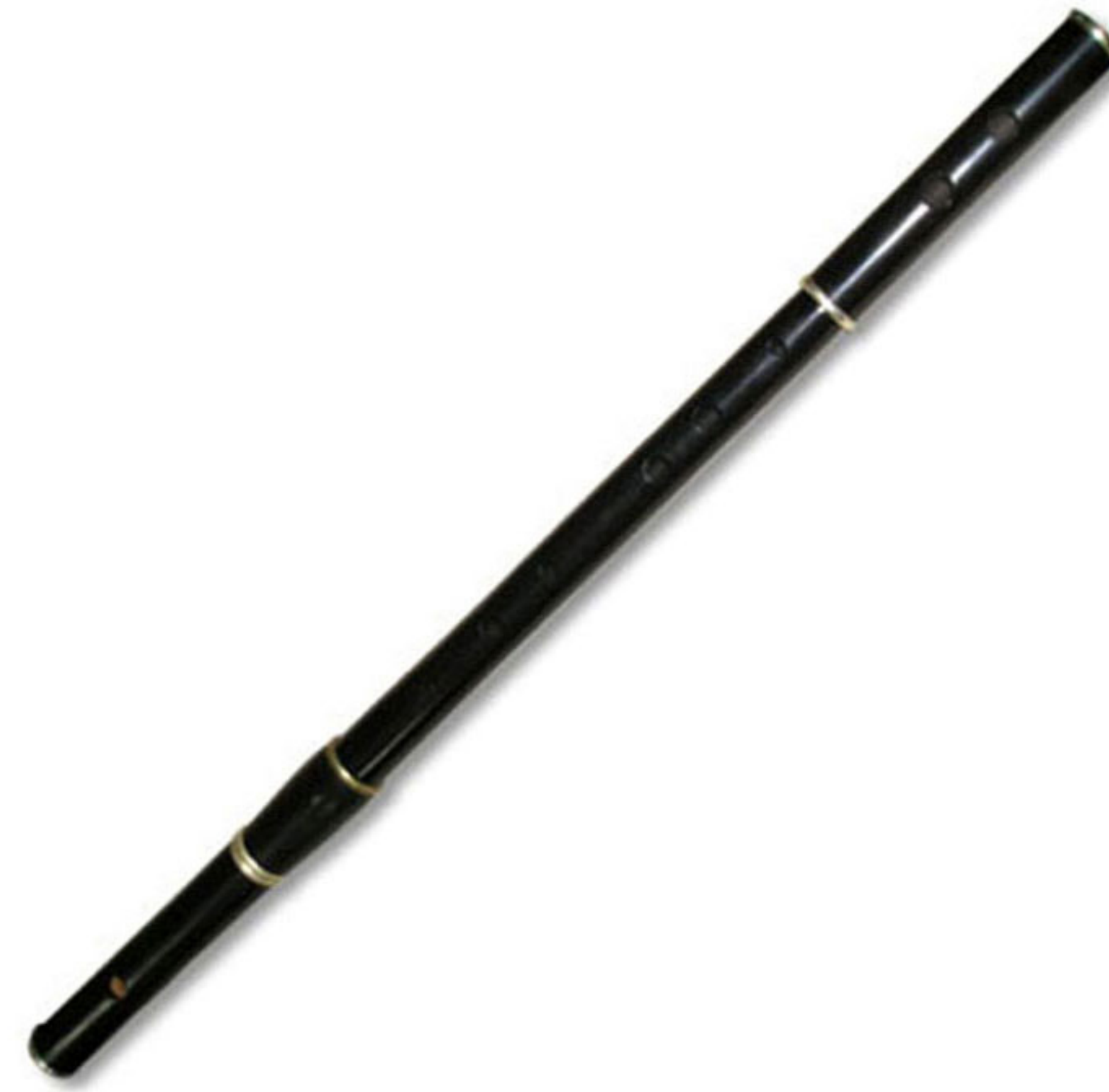
Art :- WI-229