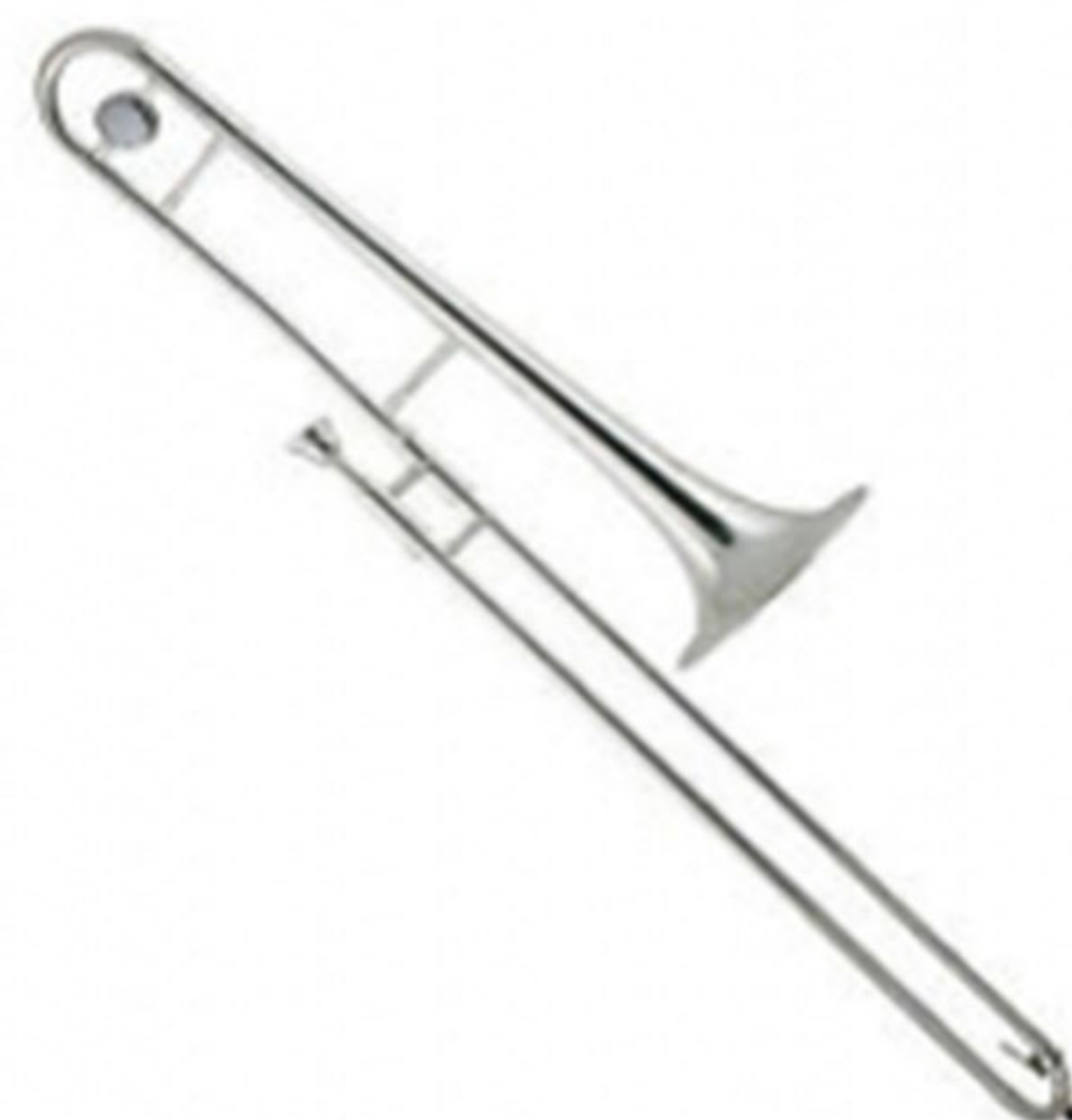
Art :- WI-206