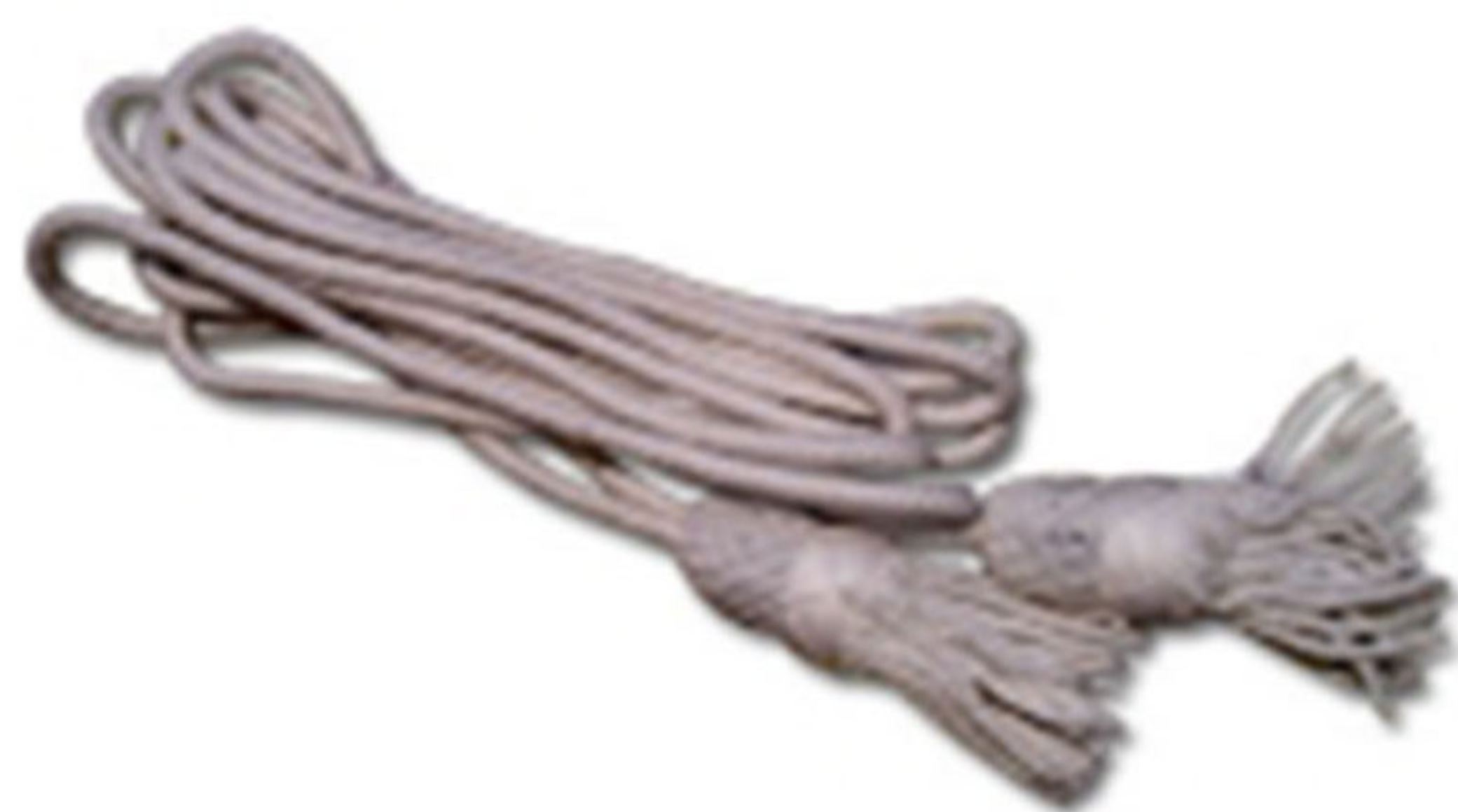
Art :- WI-254