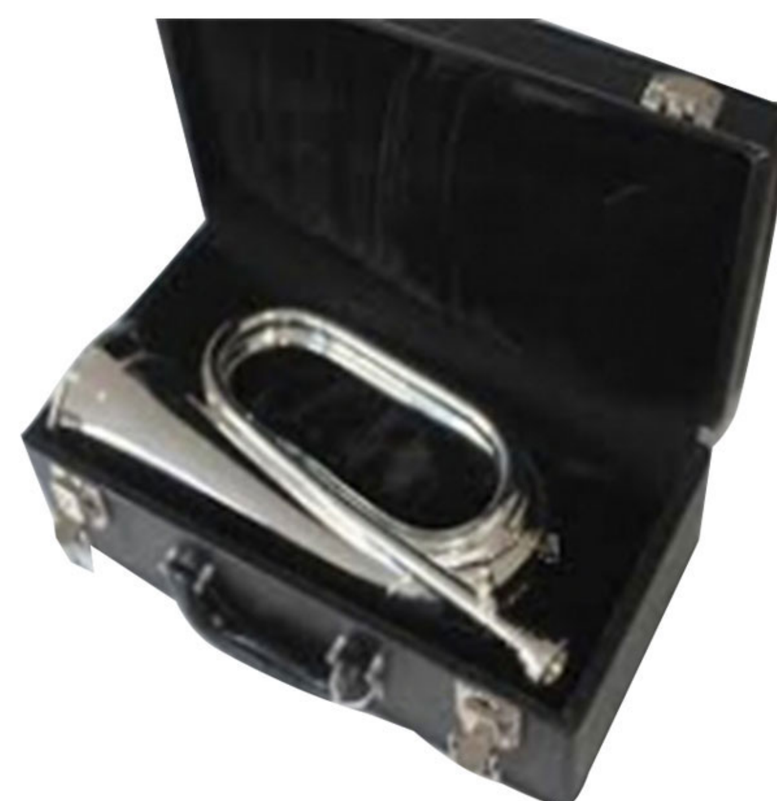
Art :- WI-222