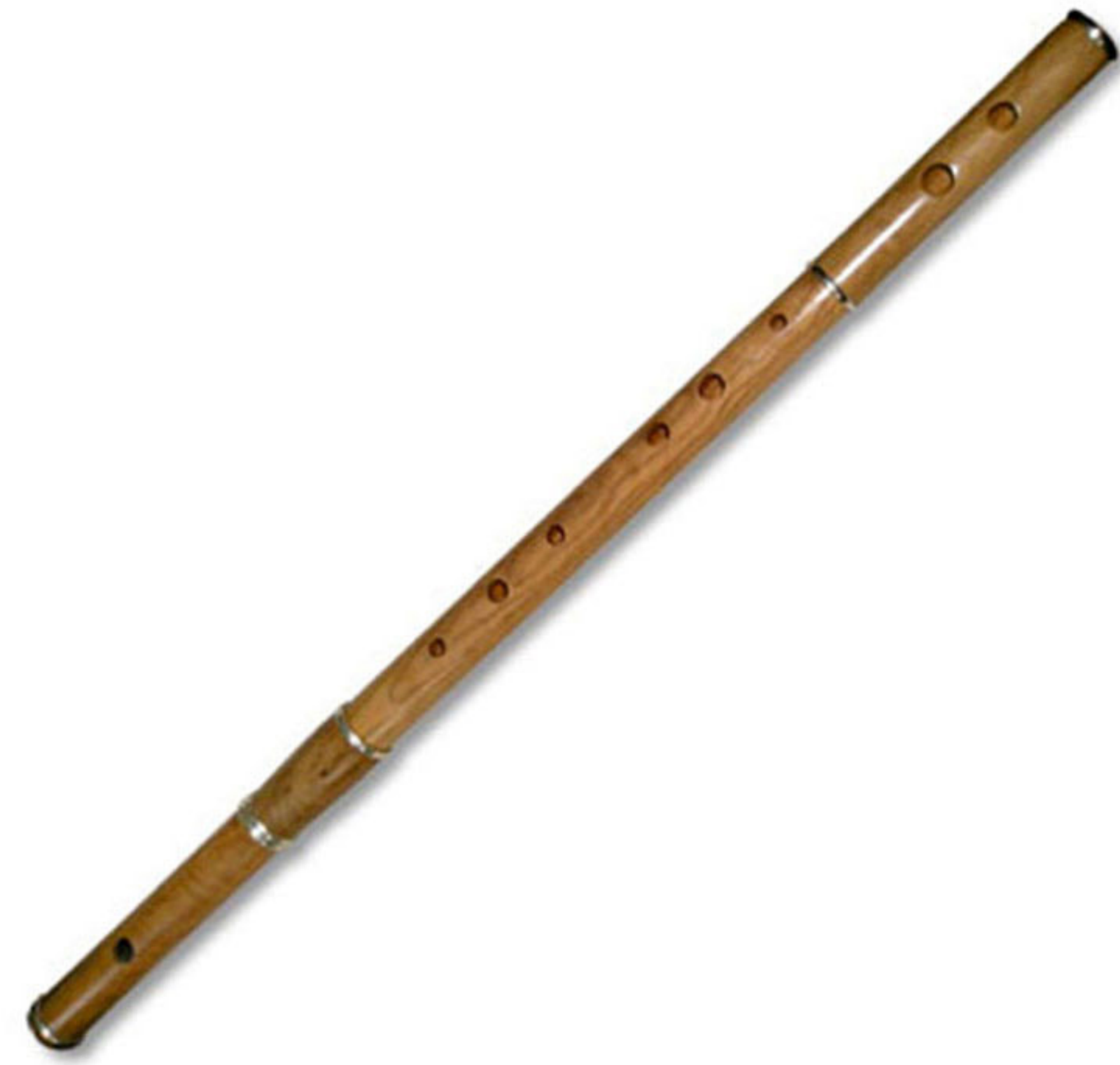
Art :- WI-230